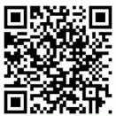
UX10 3D Demo